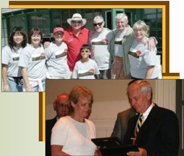
Upper Photo: Desert Southwest Conference Lower Photo: North Alabama Conference

This organization was envisioned and begun through a joint effort between the Foundation and The General Board of Discipleship. Through realizing a need for networking and community among adult workers with youth, this membership organization has now become an independent and successful ministry helping young persons answer God's call on their lives.