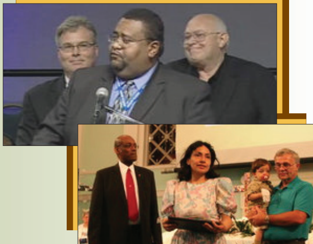
Upper Photo: North Georgia Annual Conference

It is such a blessing for us at the Foundation to read about each of the recipients. Some are pastors of new church starts, some have pastored for many years; there are laypersons who share their faith with children and young people or with those in need in their communities; there are young people leading other