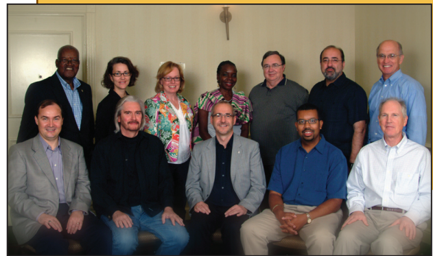
E. Stanley Jones Professors of Evangelism 13 professorships are funded whose purpose is to train pastors in the importance and the skills of helping persons experience God's transforming love through Jesus Christ

tions of leaders with a passion for evangelism. The Foundation has always been aligned with The United Methodist Church, but never more clearly than after the 2008 General Conference when one of the four ministry focus areas for the Church was set to be "developing principled Christian leaders for the church and the world."