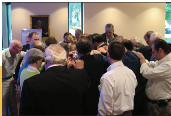
The Foundation Board of Trustees